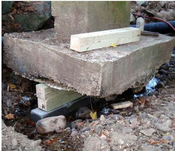
a. Pier suspended approximately 24 in.

The soil adjacent to the two piers located within the path of the creek had undergone such extensive erosion that the piers were 100% suspended. One of the piers was suspended above the soil by approximately 24 inches, as shown in Figure 2 a. The other pier which was located within the path of the creek flow had separated from main structure on December 10, 2009 such that an approximately 6in gap exists between the pier and the aerial sewer crossing. This separation of the pier from the main structure occurred two days after bypass was started, so a potential spill was prevented, but the unrepaired aerial crossing provided substantial risk of failure. Because of the location within Klinge Creek of the National Park Services, any sewage spill would have resulted in steep fines and negative press.