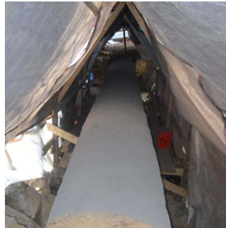
Figure 8. Tenting of project in order to provide environmental control