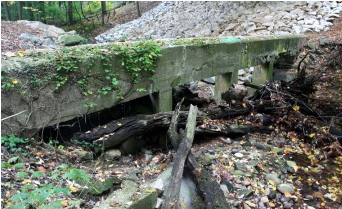
Figure 1. Original condition of the Klinge Creek aerial sewer

The aerial sewer crossing over Klinge Creek is located in North West Washington DC within the National Park Service land. The crossing was constructed in 1920 and over the past ninety years the condition of the crossing has progressively deteriorated. The condition of the crossing prior to repair is illustrated in Figure 1. The location of the crossing within land owned by the National Park Services causes substantial challenges for replacement or traditional repair options for the sewer due to the environmental considerations. To make matters worse, the only access road “Klinge Road” has been damaged and closed for 14 years due to the effects of a hurricane.