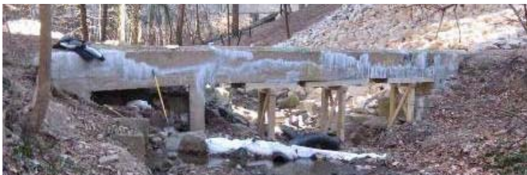
Figure 3. Temporary support structures observed at time of Jan 2010 inspection

A field inspection performed by J.W. Marshall and Associates in January 2010 showed that the central two footings shown in Figure 2 had been completely removed and replaced with wooden temporary support structures as shown in Figure 3 (Marshall, 2010).