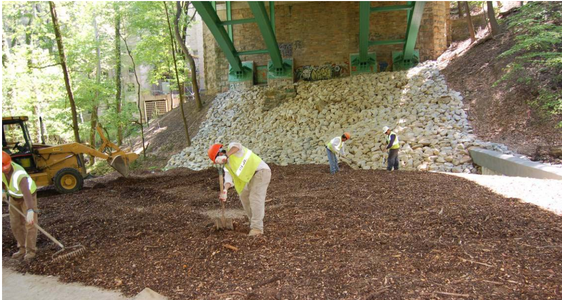
Figure 9. Environmental restoration of the surrounding area

Once Fibrwrap Construction's carbon fiber strengthening work was complete, the site along the stream and at the embankment was restored per the National Park Service's requirements as shown in Figure 9. The completed restoration of the Klinge Creek aerial sewer is shown in Figure 10.