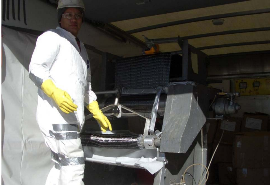
Figure 7. Carbon fiber sheet, impregnated with Tyfo ® S epoxy

Figure 7. The use of the saturator machine ensured full saturation of the carbon fiber wrap and allowed for tight quality control on the resin to fiber ratio provided for the carbon fiber composite system. Sheets of the Tyfo ® Fibrwrap ® carbon fabric were applied to the structure in the longitudinal and circumferential direction as shown in Figure 4 and Figure 5 in order to meet the project requirements.