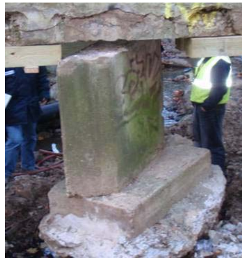
b. Pier separated from the main structure