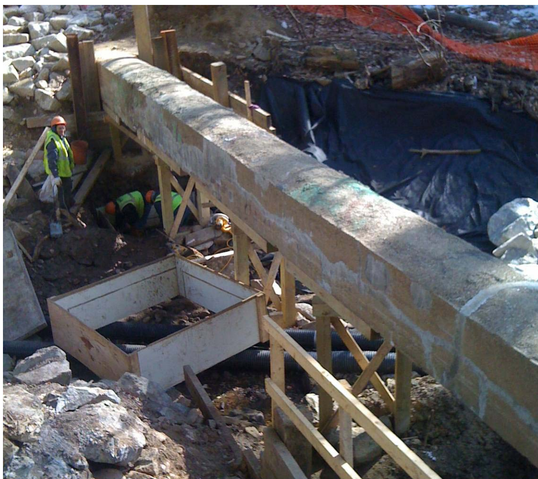
Figure 6. Aerial sewer under construction with supporting scaffolding

Prior to the executing the carbon fiber wrap portion of the scope of work, the repair of the footings and abutments recommended by J.W. Marshall and Associates were performed. While work was being performed on the crossing, the water from the creek was routed through bypass piping, as shown in Figure 6, to allow for a safe and dry construction site and to avoid potential for environmental contamination of the creek with construction debris.