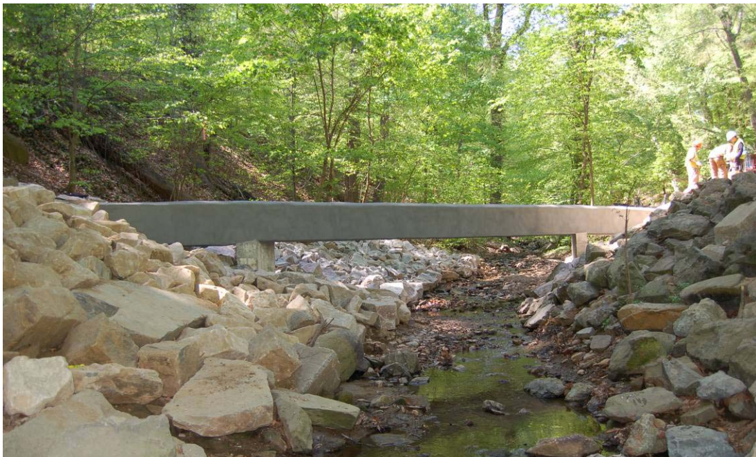
Figure 10. Completed restoration of the Klinge Creek aerial sewer