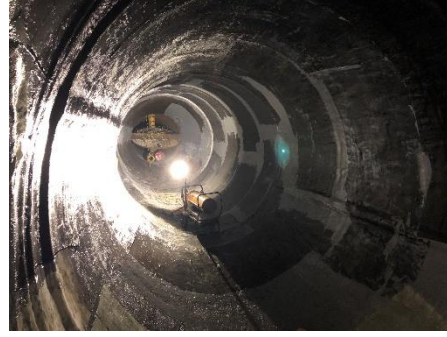
Carbon fiber laminate installation