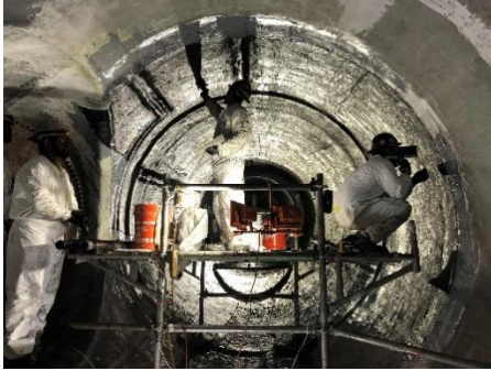
Application of tack coat.